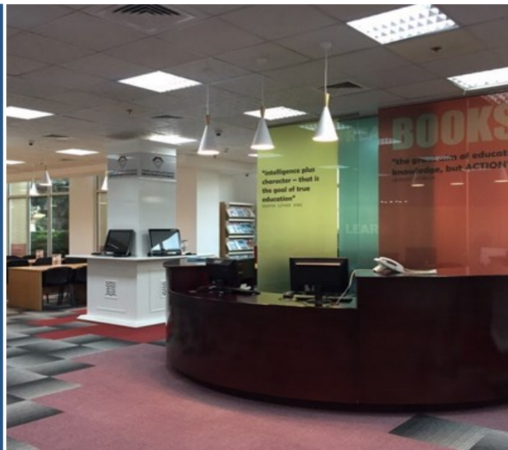
The Library Front Desk