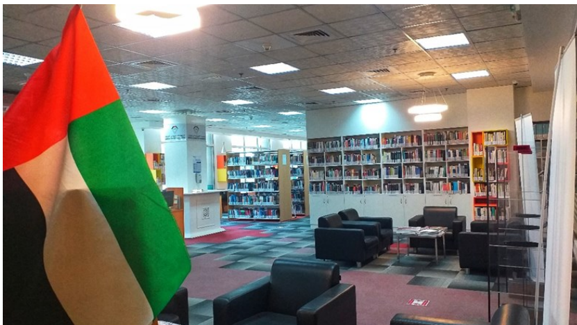
AUE's State of the Art Library

Timings Sunday to Saturdays Sunday to Saturdays