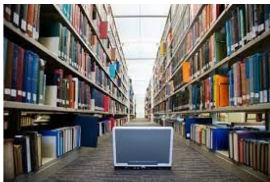
The Backbone of a Library—Databases